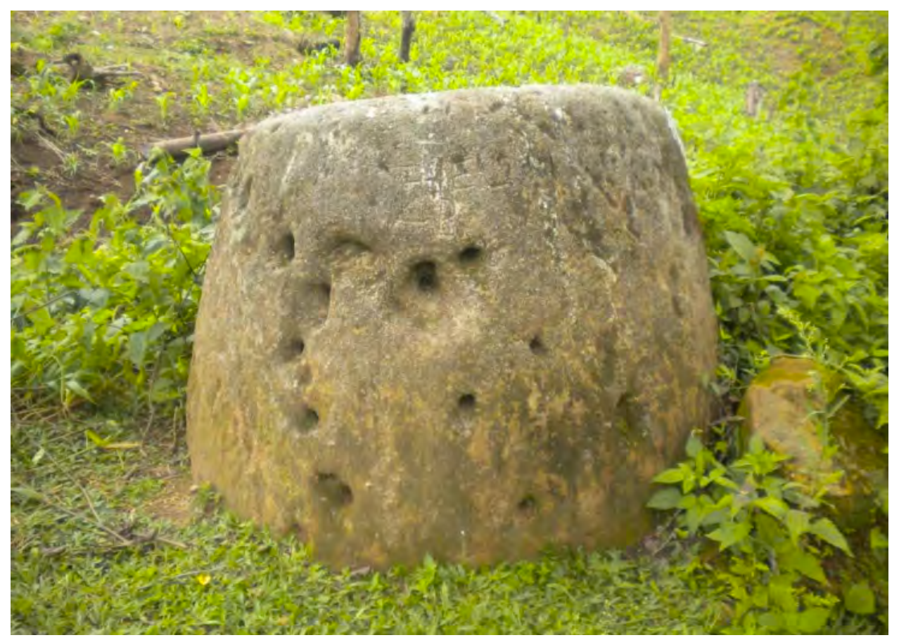
A jar riddled with bullet holes as a result of UXO. Graffiti is also visible.

Today, the Plain of Jars faces a number of conservation challenges as Laos, one of the world's least developed countries, prepares it for UNESCO World Heritage nomination. The economy created by increased tourism to the jar sites would undoubtedly help communities all across the province of Xieng Khouang, but protective mechanisms and infrastructure must first be put in place to ensure the resources' long-term sustainability.