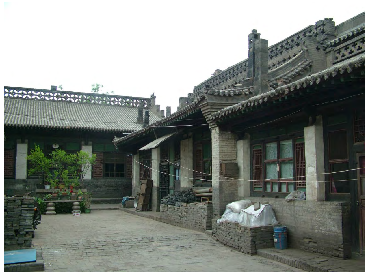
A courtyard set to be restored as part of GHF's next physical conservation project at Pingyao.