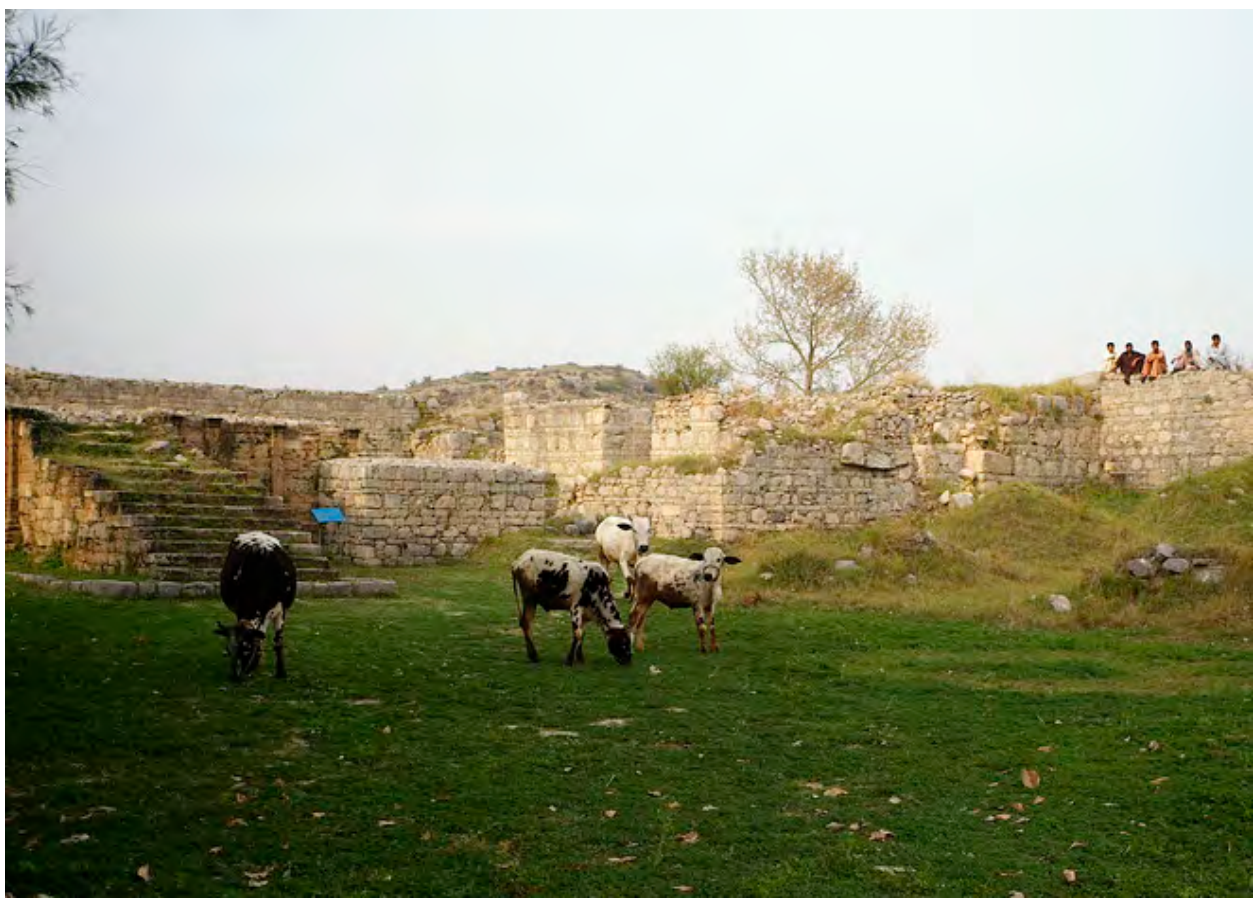
Lambs graze among Taxila's ruins.

Taxila, a diverse and wide-spanning World Heritage site, faces an equally diverse array of conservation challenges. Only with cooperation from all levels of local government will these archaeological and heritage sites be able to weather the numerous threats they face today.