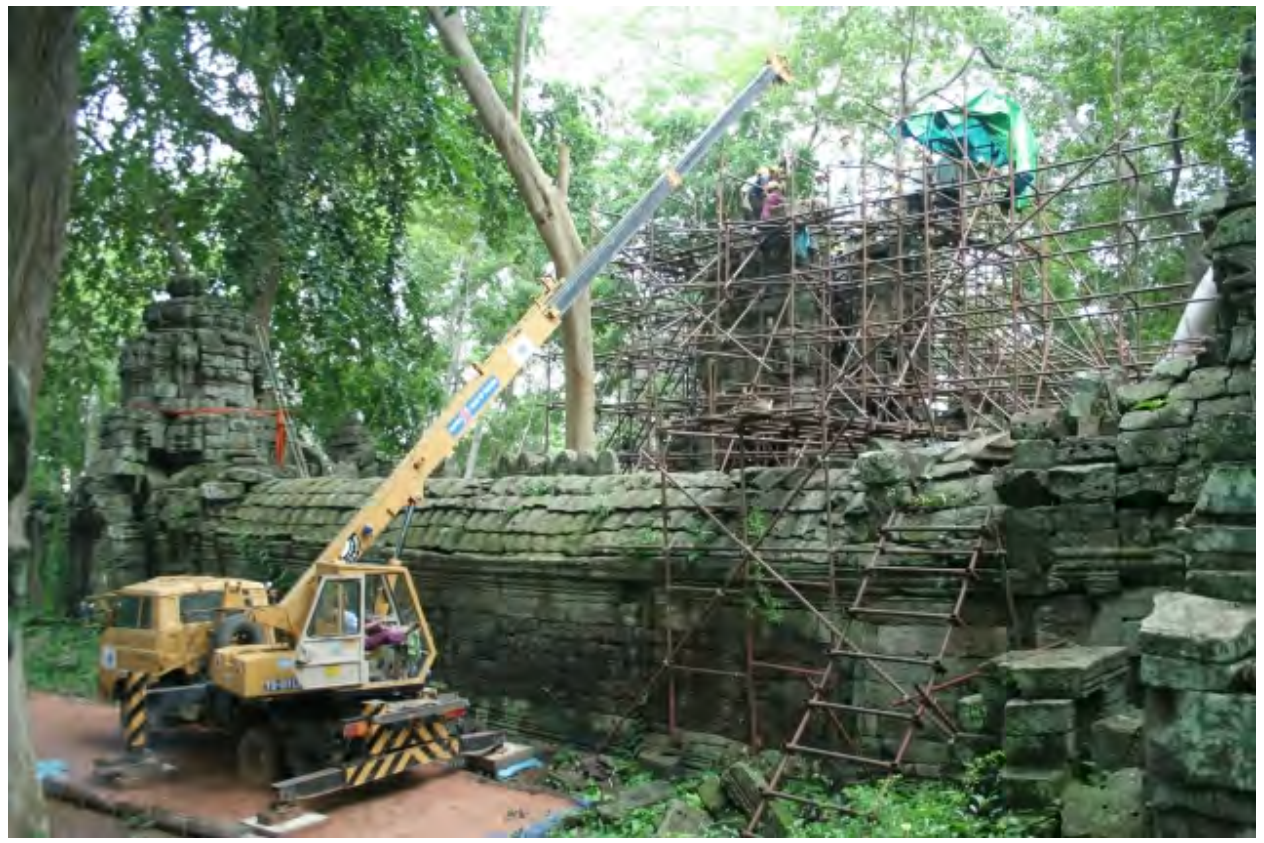
Photo: The Face Tower 18, which was heavily destabilized during heavy monsoons, receives structural support and partial disassembly with the assistance of a crane.

Sanday's vision for Banteay Chhmar is a partial ruin with low-impact, safe visitor access via suspended cable platforms over the fallen structures, along with selective interventions for high-risk structures, bas-reliefs and towers. This is a change from the standard restoration concept favored at sites like Angkor Wat, where out-of-control tourism has damaged the temples and put the site's survival in jeopardy. At Banteay Chhmar, visitors will instead experience a romantic ruin hidden for centuries — an accurate interpretation of a natural site with its mystery intact.