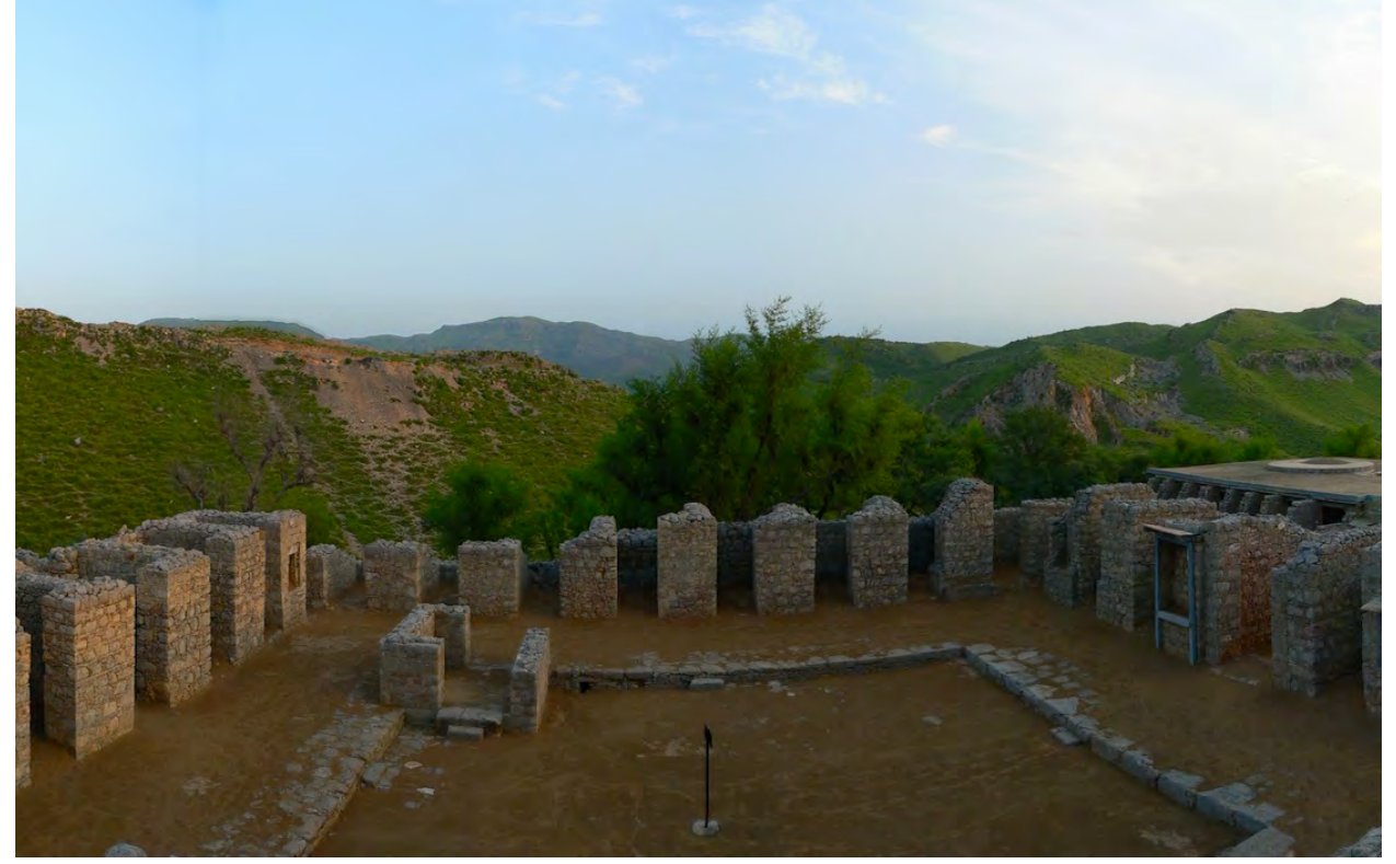
The view from one of Taxila's ancient Buddhist monasteries.

Former Crossroads of Industry in the Ancient Middle East