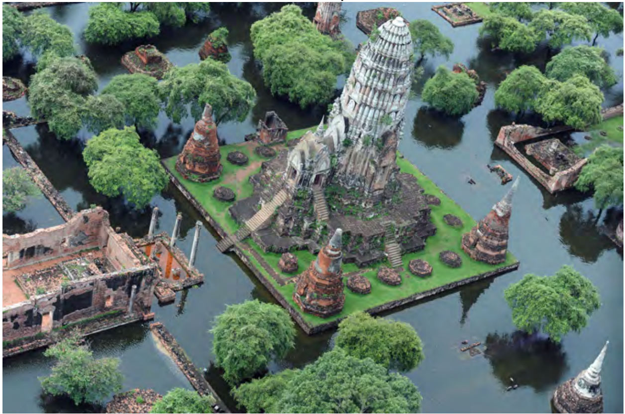
A temple surrounded by floodwaters in the ancient capital city of Ayutthaya in October 2011.

"Venice of the East," Former Siamese Capital