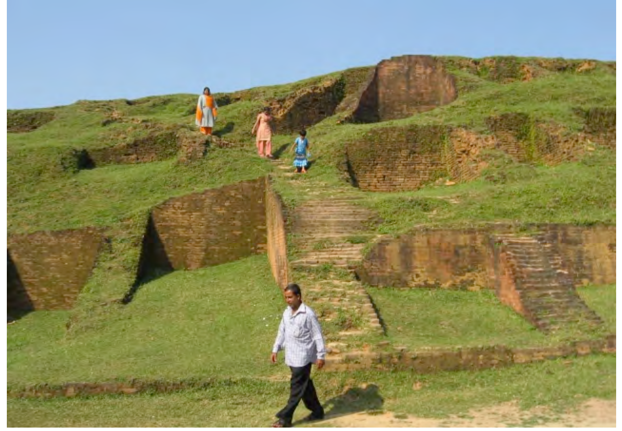
Tourists walk on the ramparts of Mahasthangarh's citadel.

One of South Asia's Earliest Urban Archaeological Sites