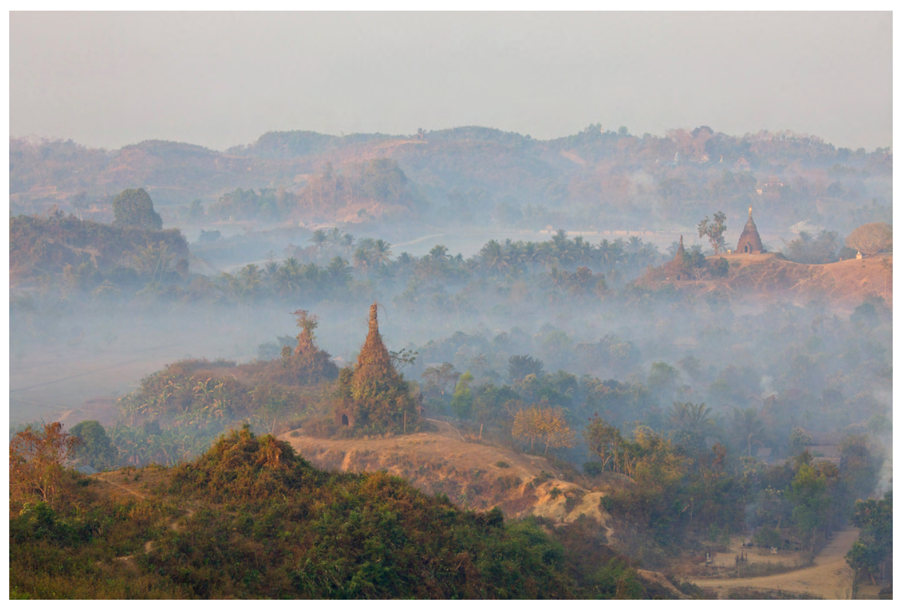
Pagodas as seen from above Myauk-U. The town has recently become a popular tourist destination, but construction of a new railroad is damaging its heritage.

"Myauk-U Archaeological Area and Monuments" was added to the UNESCO World Heritage Tentative list in 1996, but Myanmar still has not had a site officially inscribed. Today, Myauk-U is a popular destination for travelers in the region, but its residents remain poor and live without even very basic infrastructure (such as 24-hour electricity). Funding for proper conservation and sustainable development of the site would go a long way toward improving lives and ensuring the future of this once-great kingdom.