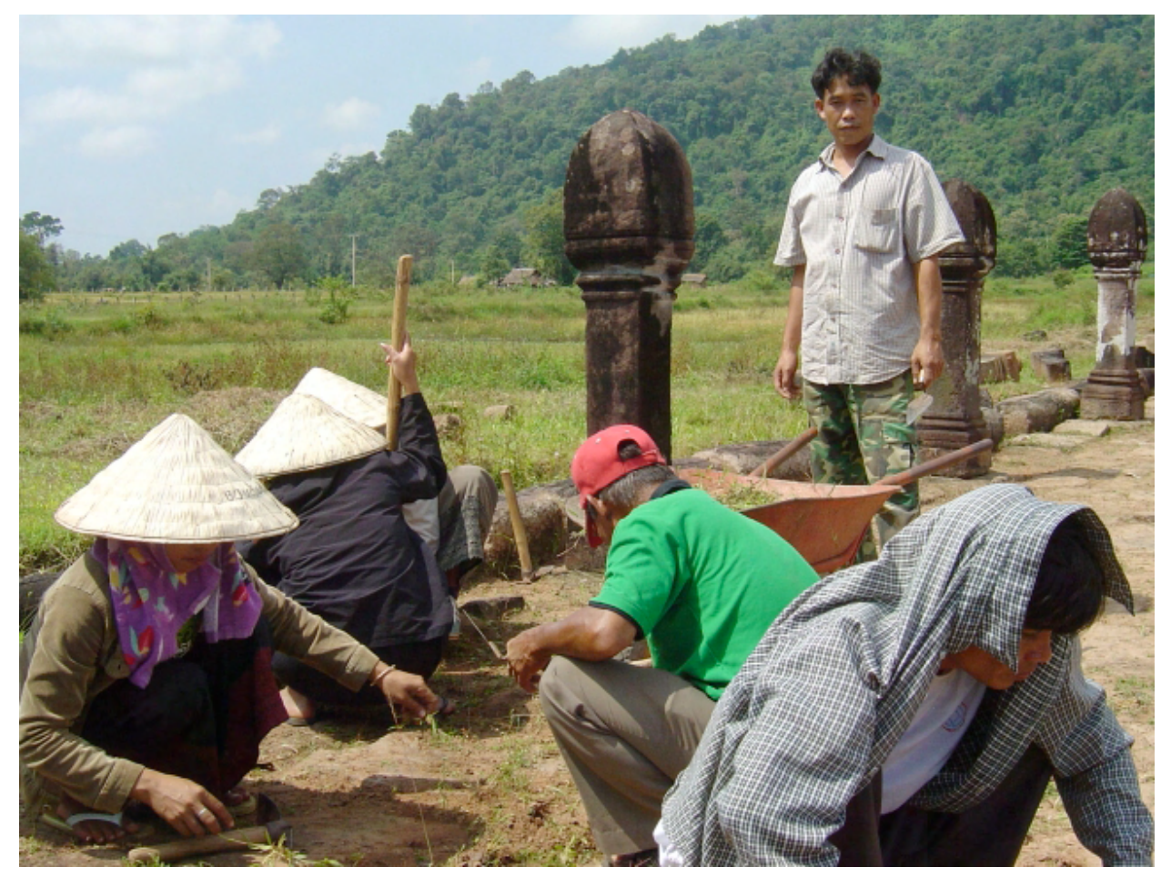
Trained local workers restoring the ancient holy road leading to Wat Phu.

The local community around Wat Phu has benefited greatly from tourism growth and park infrastructure developments. In 2005, before GHF's project work began, the park was seeing under 20,000 tourists per year. Today it attracts over 250,000 annually, including approximately 200,000 international tourists who each pay six dollars for entry, generating $1.2 million for the government. A new $2 million road connects Wat Phu directly to the Pakse airport within 20-30 minutes, eliminating the need for a river crossing, while the airport itself, primarily for visitation to Champasak and Wat Phu, has been upgraded and now serves international flights to other UNESCO World Heritage locations like Siem Reap, Da Nang, and Luang Prabang.