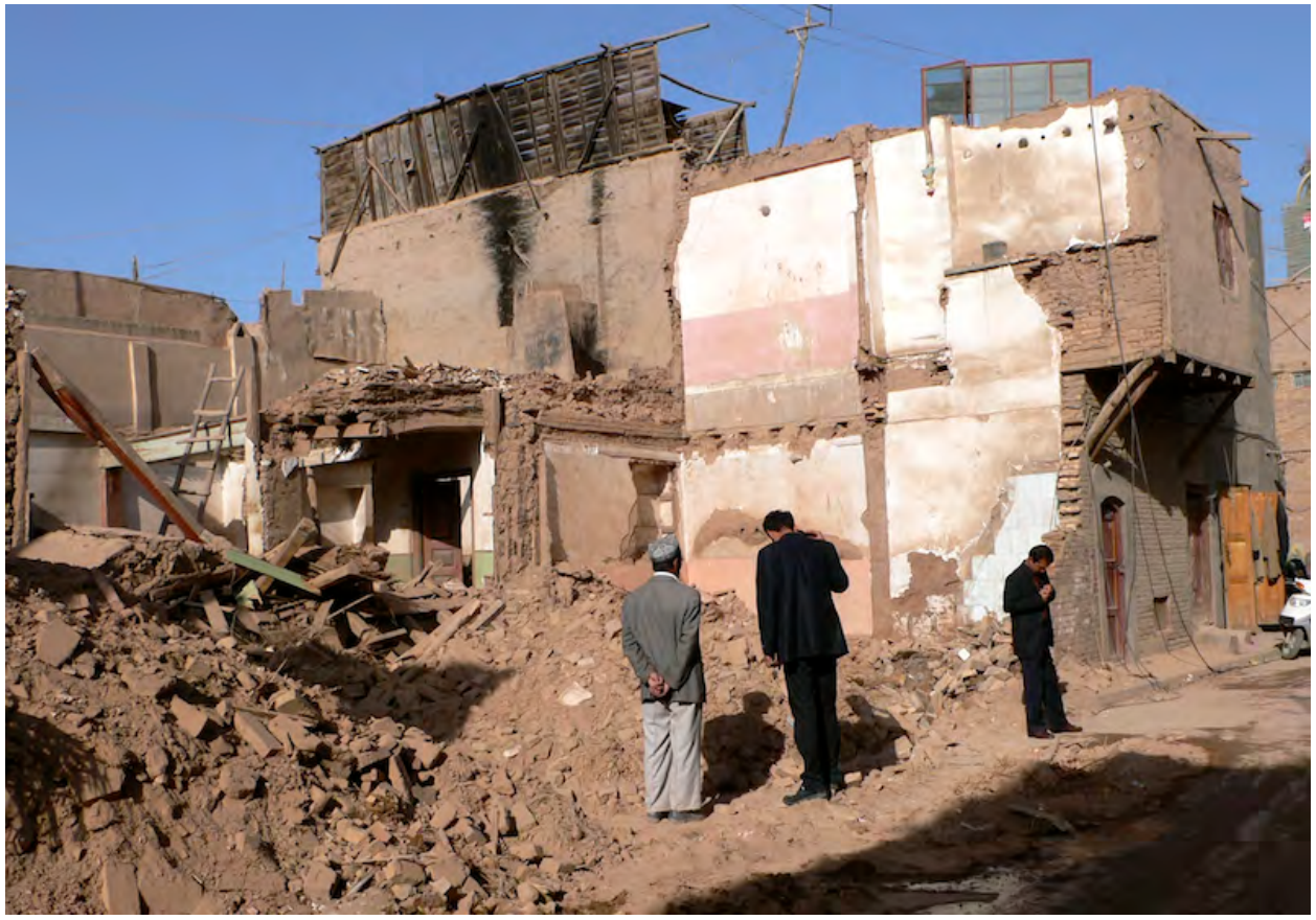
An example of a neighborhood in Kashgar's old town, destroyed to make way for urban housing developments.

The MEP resolution urged the Chinese government to reverse its course in Kashgar and consider the irreplaceable treasures being destroyed every day. But ethnic tensions have not relaxed between Muslim Uyghurs and Han Chinese in Xinjiang province, with political and economic factors contributing to a resurgence of violence in Kashgar in 2012. Without a comprehensive inquiry into culture-sensitive renovation methods, the future of this Silk Road relic hangs delicately in the balance