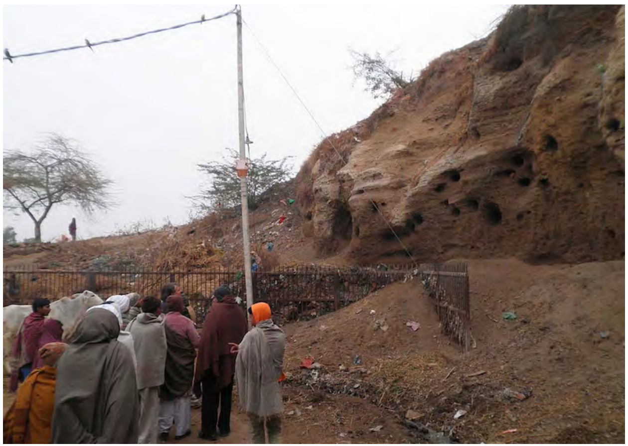
This mount has been dug into both for saleable items and to accommodate the construction of a road.

If preserved and excavated, Rakhigarhi can teach the world about the Indus, whose ancient history rivals the Egyptians, Mesopotamians and Mayans in terms of global significance. Easily accessible from India's capital, the site also has potential as a major ecotourism site, which would create jobs, diversify industry in the villages around Rakhigarhi, and enable key improvements in the areas of sewage and drainage, sanitation and solid waste management, roads and electrical improvements, and other forms of infrastructure.