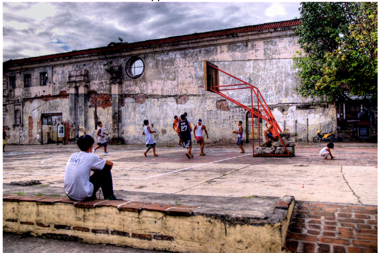
Teenagers play basketball within the ruins of Intramuros' San Ignacio Church, which was mostly destroyed during World War II.