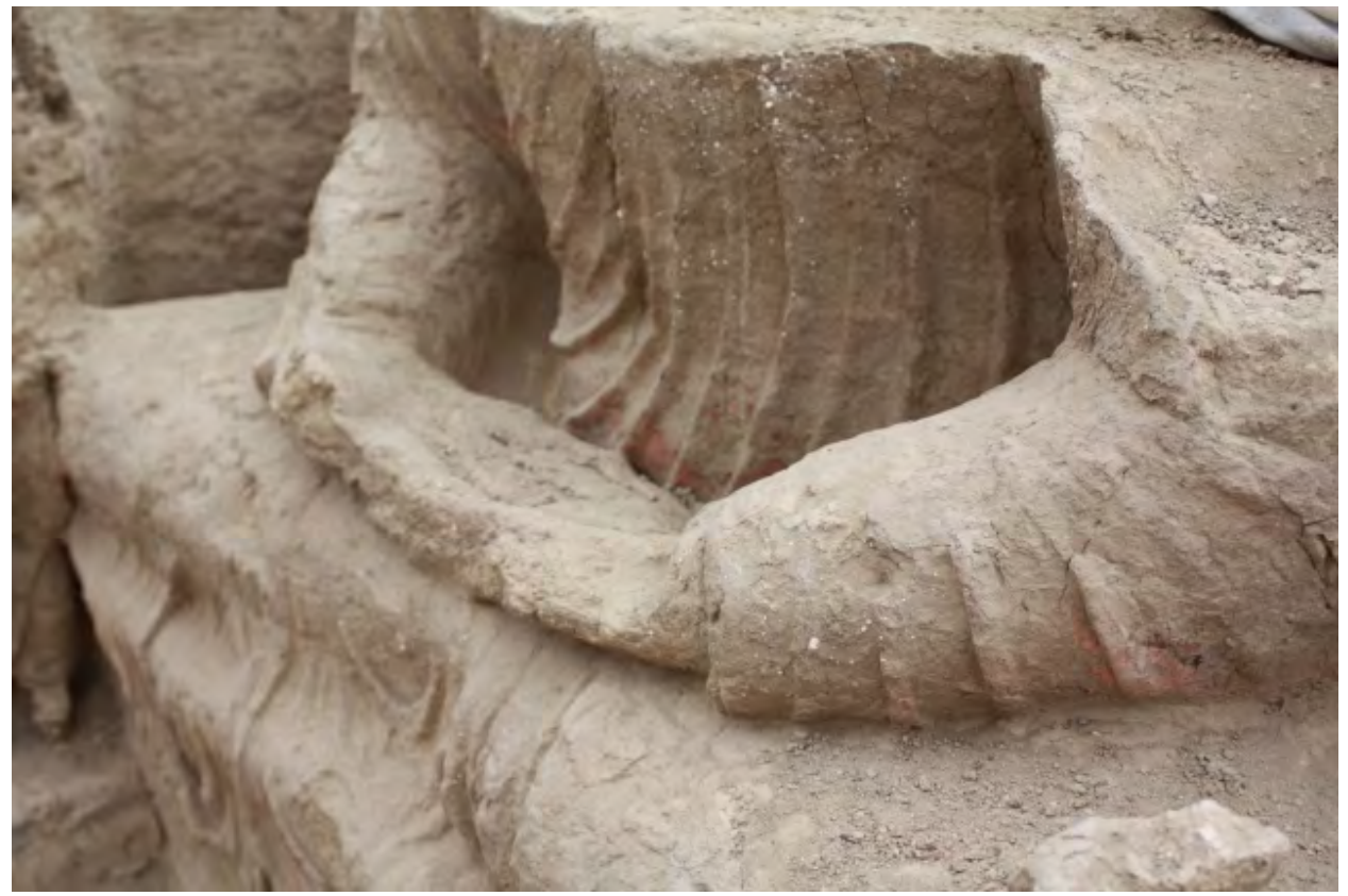
An ancient Buddhist statue at Mes Aynak.

Under the circumstances, the team of French and Afghan archaeologists at Mes Aynak have done an admirable job of excavating the site, with many artifacts moved already to the National Museum. There are also plans by the Ministry of Information and Culture to create a site museum in Logar district (much closer to the site than the National Museum) where the majority of the larger artifacts can be displayed. Sadly, there appears to be little hope for the actual complex, which will be totally destroyed once mining begins.