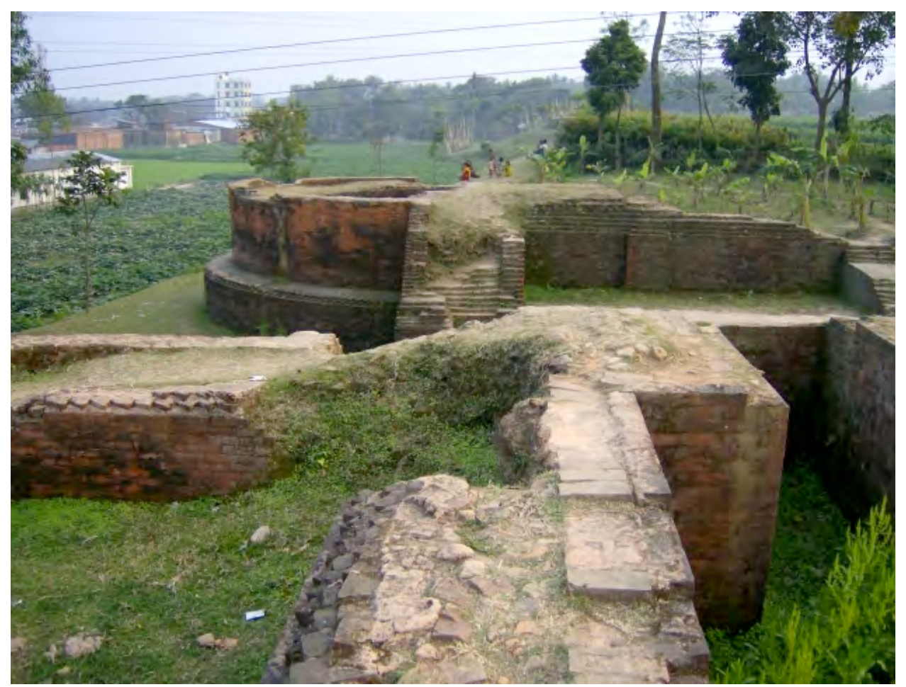
An example of encroaching agriculture directly on top of archaeological features. In this case, a field of banana trees is tended right atop the ancient city wall gate.

Mahasthangarh was declared a protected area by the national government in 1920, but efforts to safeguard it have become increasingly futile. Because only government-owned or occupied areas fall under control of the government conservation authority, most of the lands surrounding Mahasthangarh — which are owned by local people — can not be preserved or excavated without a lengthy legal intervention.