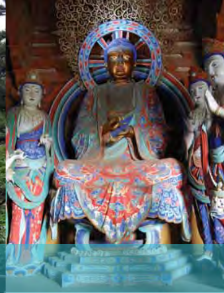
Left: Hampi, India Center and right: Foguang Temple, China

Humankind's most important archaeological and cultural heritage sites in developing countries are under threat like never before from uncontrolled development, mass tourism, looting and environmental degradation. Yet these sites generate cultural pride and billions of dollars every year for developing nations.