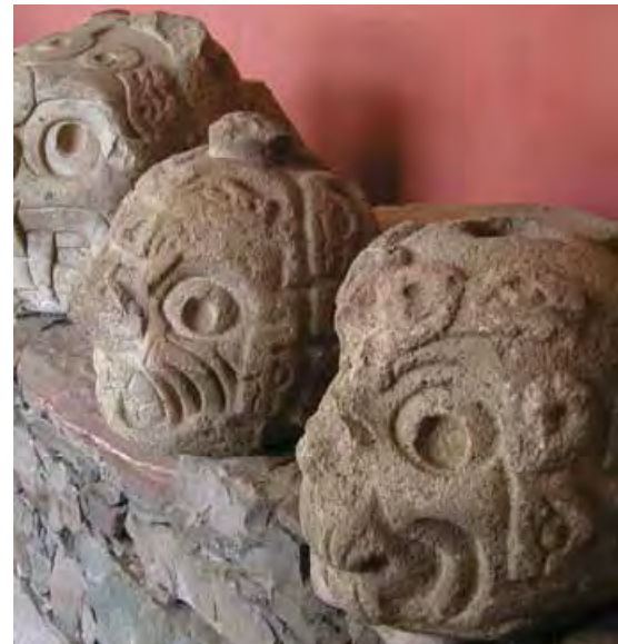
Above: Chavín de Huántar, Peru

Invited participants will share their own experiences from business, government, academia and conservation through afternoon workshop sessions and expert panels will discuss the challenges and innovative solutions in heritage conservation, master planning, site management, sustainable preservation and tourism, and integrated community development in the Americas, Asia, Eastern Europe, the Middle East and Africa.